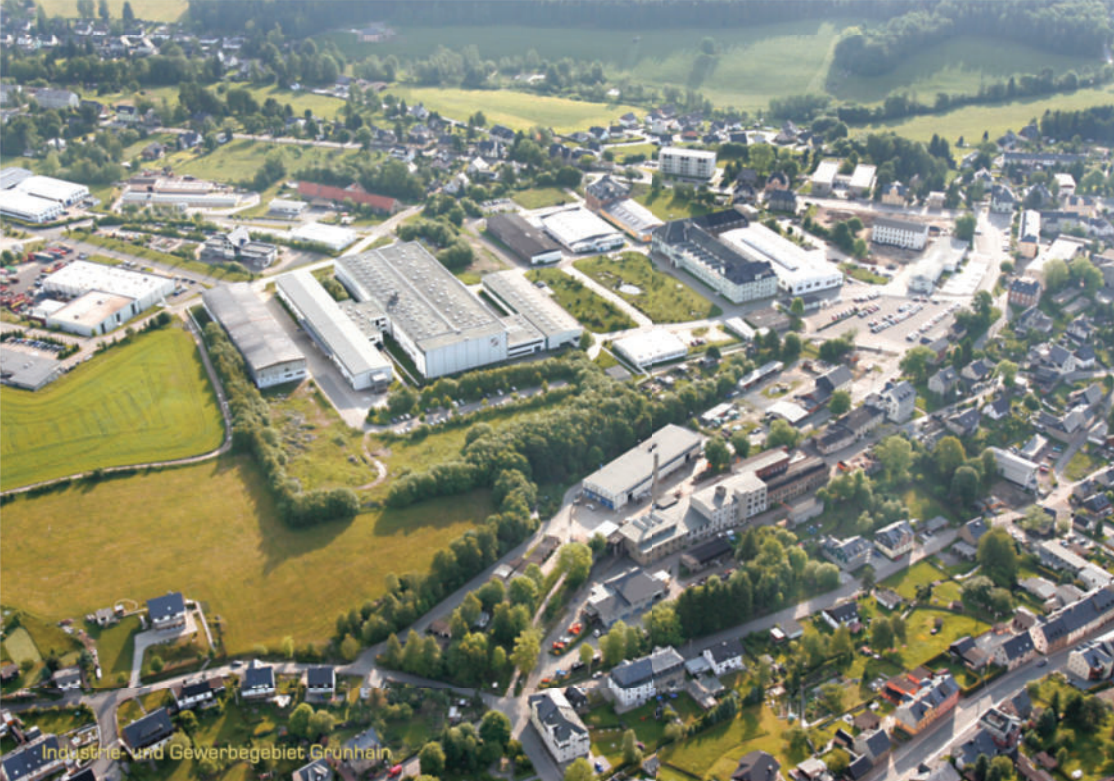
Industrie- und Gewerbegebiet Grünhain